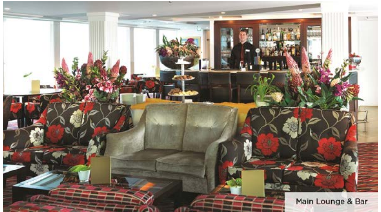
Main Lounge & Bar