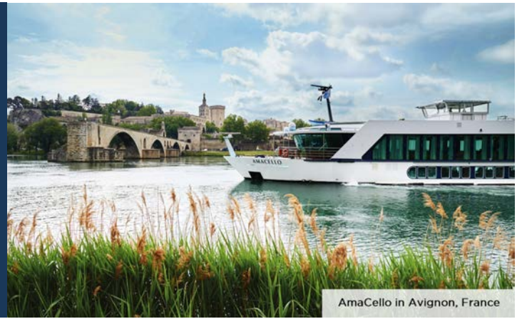
AmaCello in Avignon, France

7-night cruise from Arles to Chalon-sur-Saône November 9-16, 2023 | AmaCello