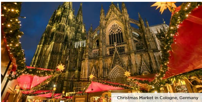
Christmas Market in Cologne, Germany